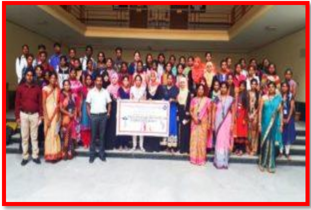
Workshop on Bioinformatics on 23<sup>rd</sup> and 24<sup>th</sup> October 2017