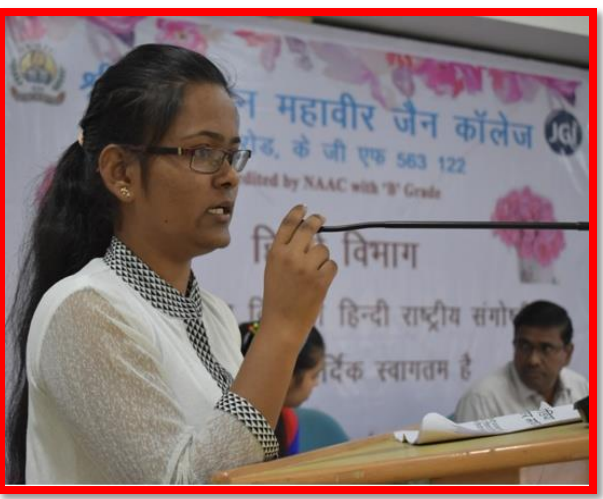
Guests for students seminar and paper presentation by the students