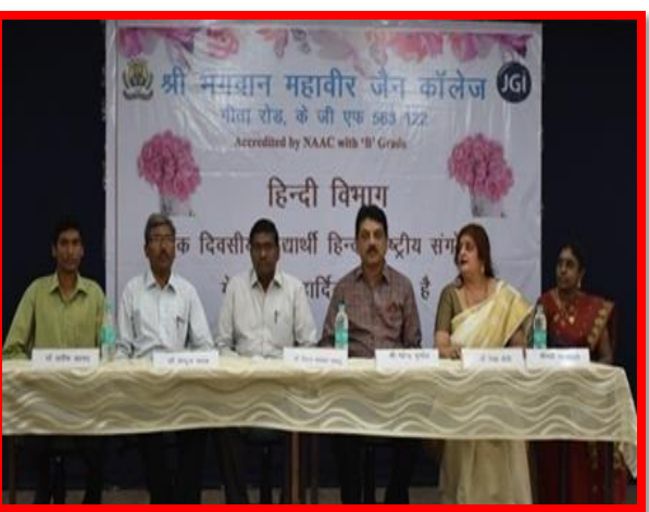
Inaugural session and technical sessions