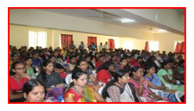
National Level IQAC Conference 7<sup>th</sup> September 2018