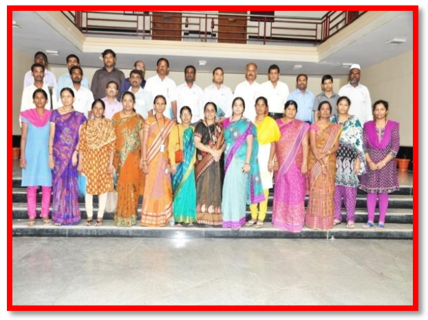
Workshop on e-granthalaya on 09th jan 2014 & 10th jan 2014.